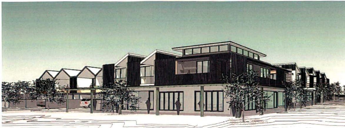
Corner Victoria & Margaret Streets Perspective