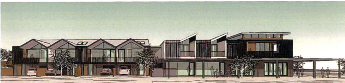
Margaret Street Perspective