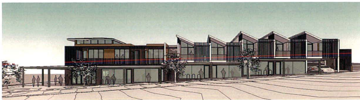
Victoria Street Streetscape