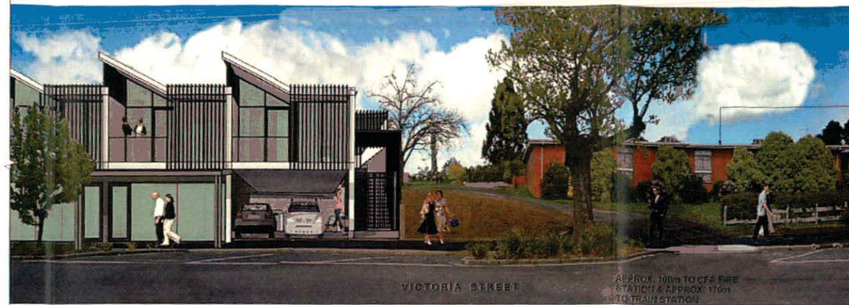
B ► Proposed Victoria Street Streetscape of Units 10/11/12 & Retails 1 & 2 Not To Scale